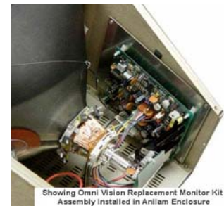
Showing Omni Vision Replacement Monitor Kit Assembly Installed in Anilam Enclosure